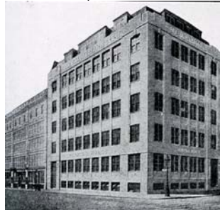
Head Office: Farringdon Rd London