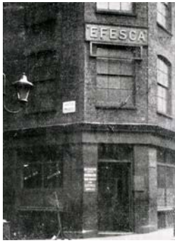
Trade counter At Saffron Hill/Castle Street London (Previously The Golden Anchor, site of 1865 melee between British & Italian button and picture-frame and looking glass manufacturers. Saratino Pelizzioni accused of murder.)