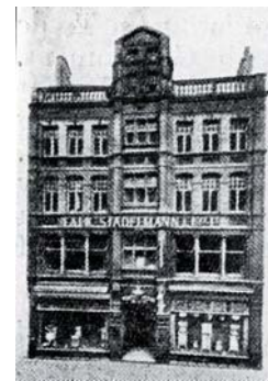
Leeds and Bradford 1930