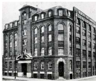
Manchester & Liverpool 1913

The Veritas Mantle Works enabled FS&Co to dominate the market but it was John Hassell's poster of a lamplighter with ladder over his shoulder breaking the street gas light, but not the mantle (subtitled "Not broken? It's a Veritas" and later simply "Blimey, it must be a Veritas") that gave force to the marketing.